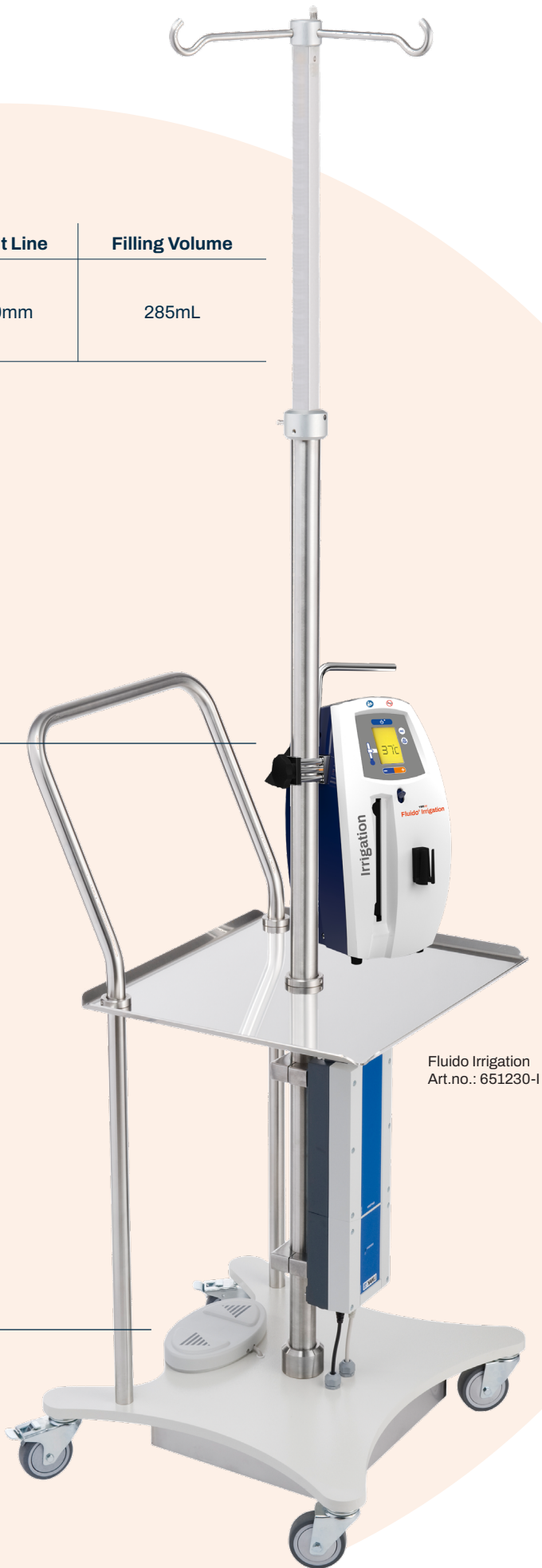
Fluido Irrigation Art.no.: 651230-I